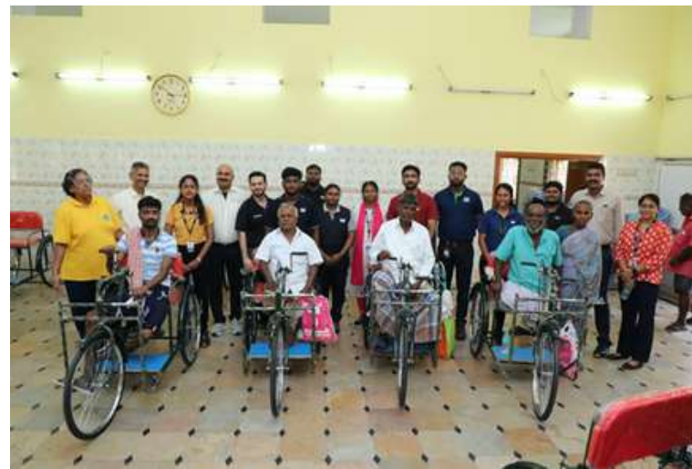
Caterpillar Team Distributing Limbs