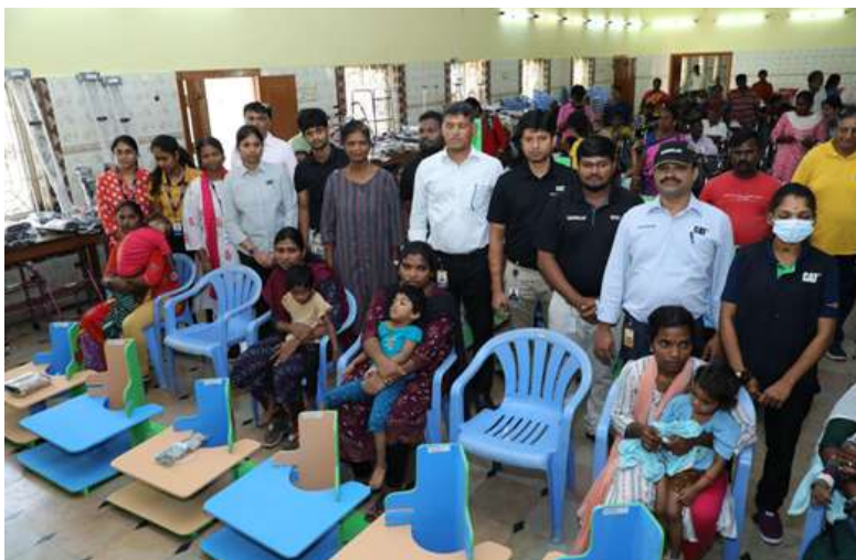
Caterpillar Team Distributing Limbs